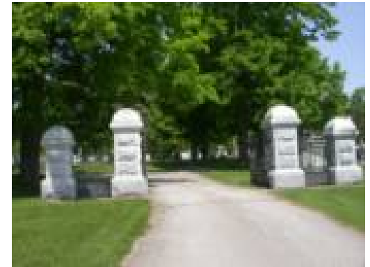
The Gates of Elmwood

The gates of Elmwood Cemetery are left open, to give an inviting feeling to all who wish to use the cemetery's park like setting. The cemetery has regular walkers and visitors going through most days of the week.